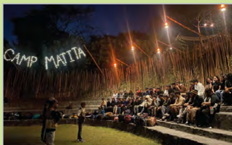
Duke of Edinburgh Award Program students, Senior Campus Uttara, Fieldtrip to Mati-ta