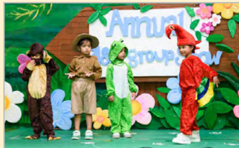
Annual Playgroup Show, Junior Campuses Gulshan & Banani