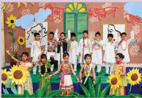
Junior Campus Banani