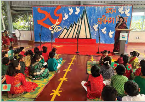
Junior Campus Banani