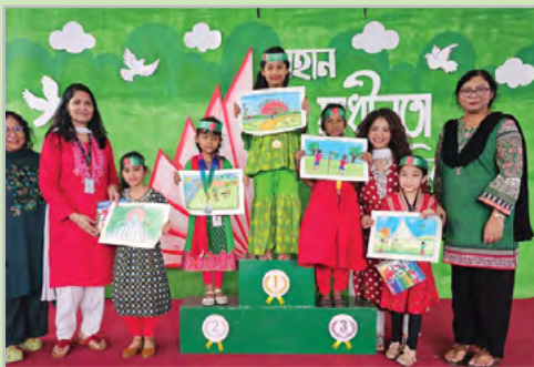
Junior Campus Uttara