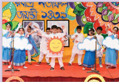
Junior Campus Gulshan