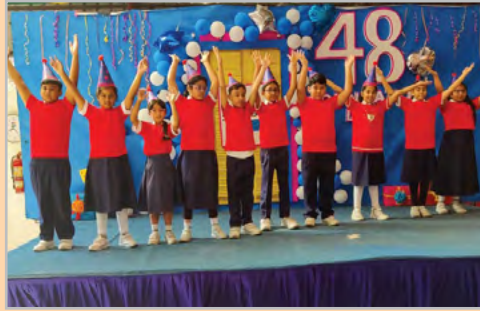
Junior Campus Gulshan