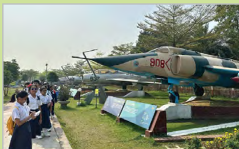
Classes III-IV, Junior Campus Dhanmondi, Fieldtrip to Bangladesh Air Force Museum