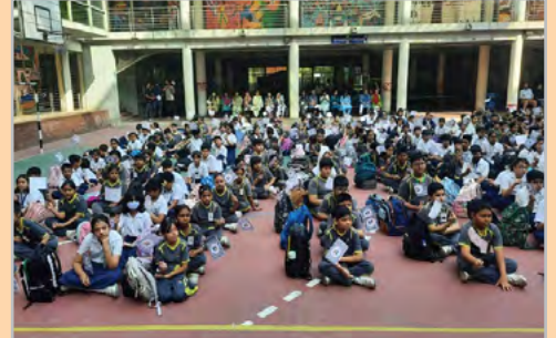
Senior Campus Uttara