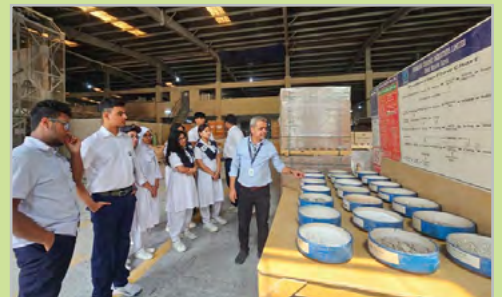
Class XI, Mirpur Campus, Fieldtrip to Paragon Ceramic Factory