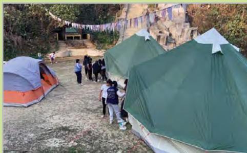
Duke of Edinburgh Award Program students, Mirpur Campus, Fieldtrip to Mati-ta