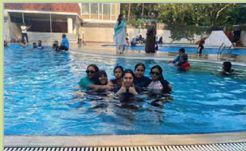
Class XII, Senior Campus Uttara, Fieldtrip to Sarah Resort