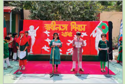
Junior Campus Dhanmondi