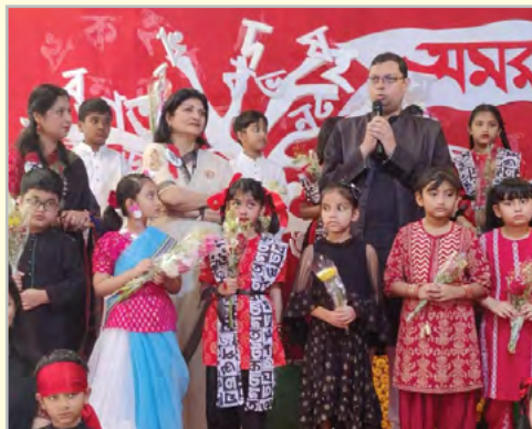
Junior Campus Gulshan