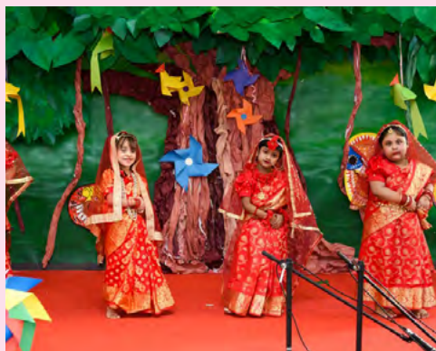
Junior Campus Gulshan