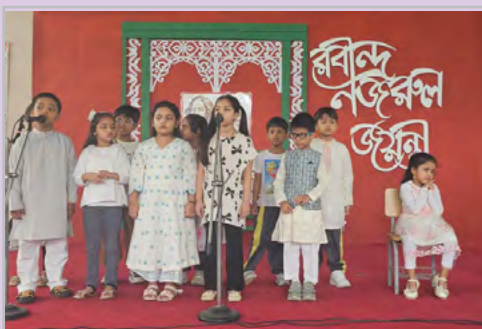
Junior Campus Uttara