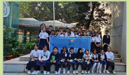
Classes I-II, Mirpur Campus, Fieldtrip to Bangladesh Bank Taka Museum