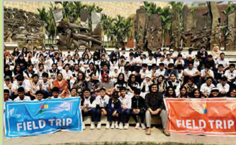
Class V, Mirpur Campus, Fieldtrip to Military Museum