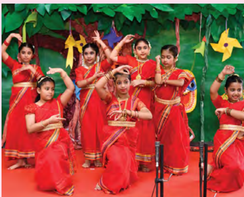
Junior Campus Banani