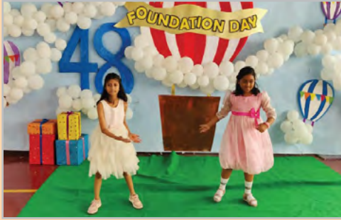
Junior Campus Banani