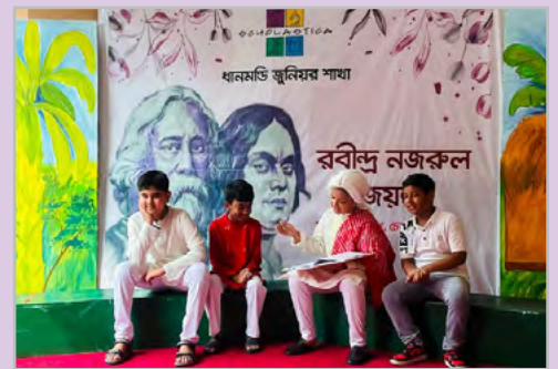
Junior Campus Dhanmondi