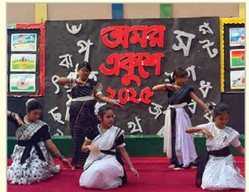
Junior Campus Dhanmondi