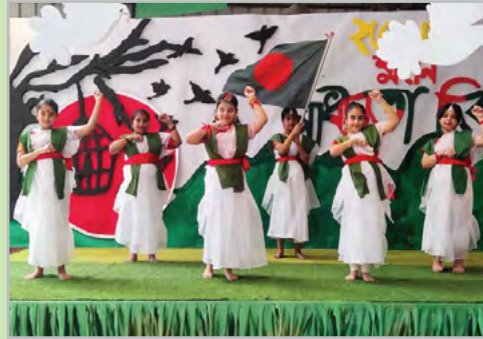
Junior Campus Gulshan