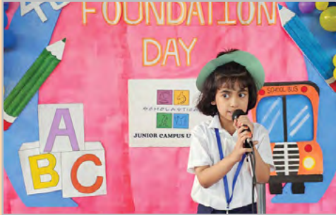
Junior Campus Uttara