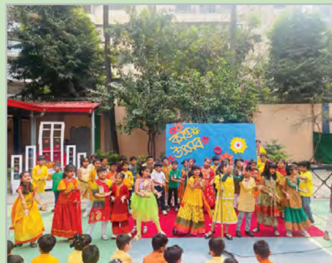
Junior Campus Dhanmondi