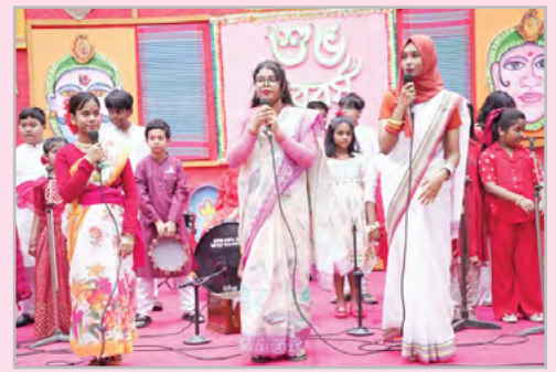
Senior Campus Uttara