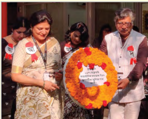
Junior Campus Banani