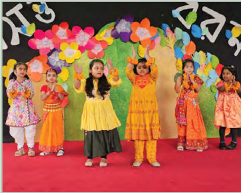
Junior Campus Uttara