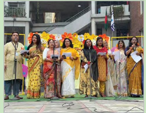
Senior Campus Uttara