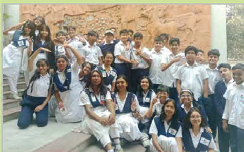
Class VI, Senior Campus Uttara, Fieldtrip to Bangladesh Bank Taka Museum