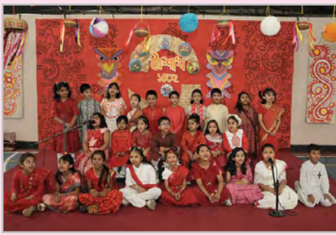
Junior Campus Uttara