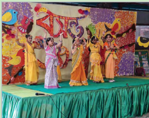
Junior Campus Gulshan