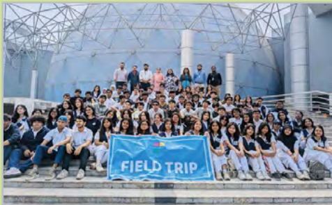
Class IX, Mirpur Campus, Fieldtrip to Novo Theatre

During the second term, students went on educational field trips to different locations in Bangladesh. These trips help children make connections between classroom learning and the real world in Dhaka and Bangladesh.