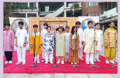
Senior Campus Uttara