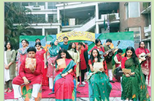
Senior Campus Uttara