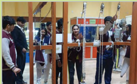
Class X, Mirpur Campus, Fieldtrip to National Museum of Science & Technology