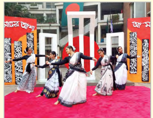
Senior Campus Uttara