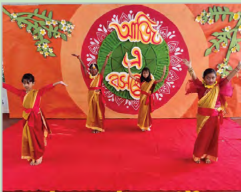
Junior Campus Banani