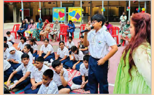
Junior Campus Dhanmondi