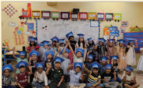
Annual Junior Program, Mirpur Campus