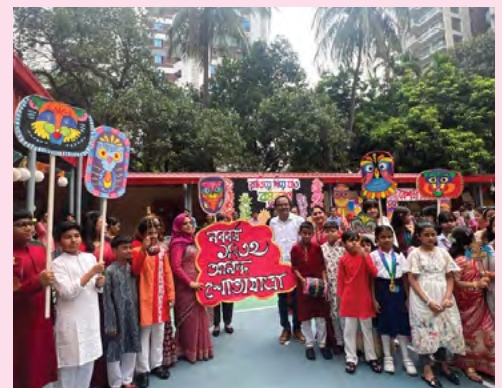
Junior Campus Dhanmondi