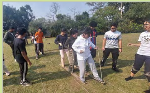
Duke of Edinburgh Award Program students, Senior Campus Uttara, Fieldtrip to Basecamp