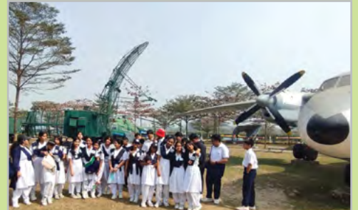
Class VI, Mirpur Campus, Fieldtrip to Bangladesh Air Force Museum