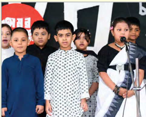
Junior Campus Uttara