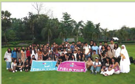
Class XII, Mirpur Campus, Fieldtrip to Sarah Resort